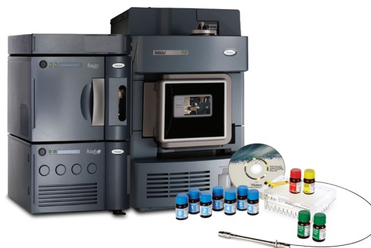
Figure 1. The Waters ACQUITY UPLC I-Class/Xevo TQD IVD System and MassTrak Vitamin D Kit.

The MassTrak Vitamin D Kit, a component of the MassTrak Vitamin D Solution is validated for use with the Waters ACQUITY UPLC I-Class/Xevo TQD IVD System and the sample preparation has been validated using the Tecan® Freedom 100/4 EVO® Offline Automated Liquid Handling system.