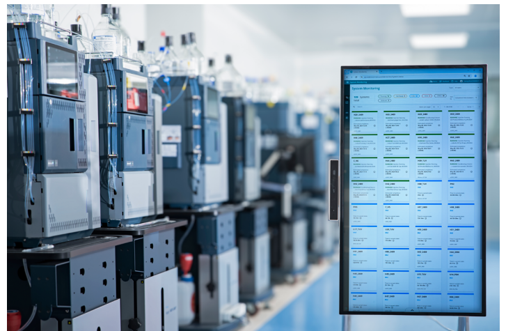
CKD are able to easily monitor their significant HPLC instrument fleet, including their Alliance iS HPLC Systems shown above, in real-time using waters_connect System Monitoring in their QC laboratory.