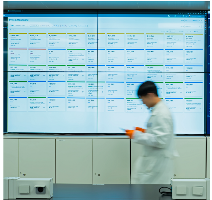
CKD have benefited significantly from the implementation of waters_connect System Monitoring on large monitors in their preparation area, providing a dynamic, real-time view of their QC laboratory.

"Real-time checking has become possible from anywhere, at anytime, and we have set up dashboards on large monitors in the preparation area to monitor all HPLC instruments," says Yoon. "This has improved the efficiency of our analysis operations and allowed for continuous monitoring, contributing to productivity improvements." The ability to monitor equipment remotely ensures that the lab can maintain optimal operational status, significantly reducing delays and enhancing overall productivity.