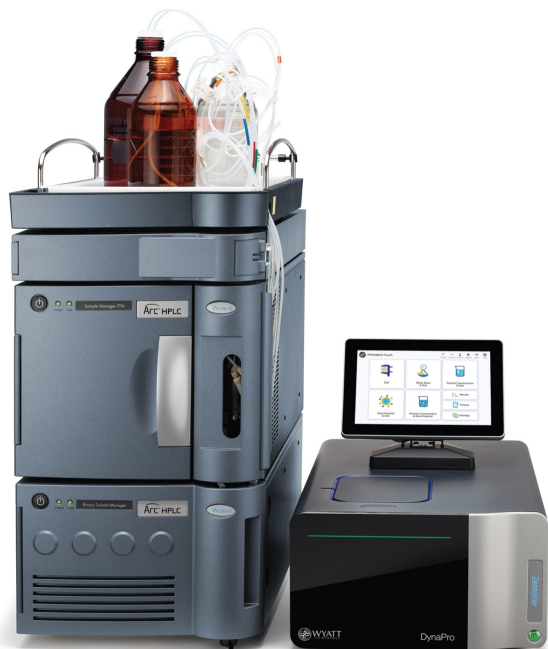
Figure 1. Waters Arc HPLC and DynaPro ZetaStar System.