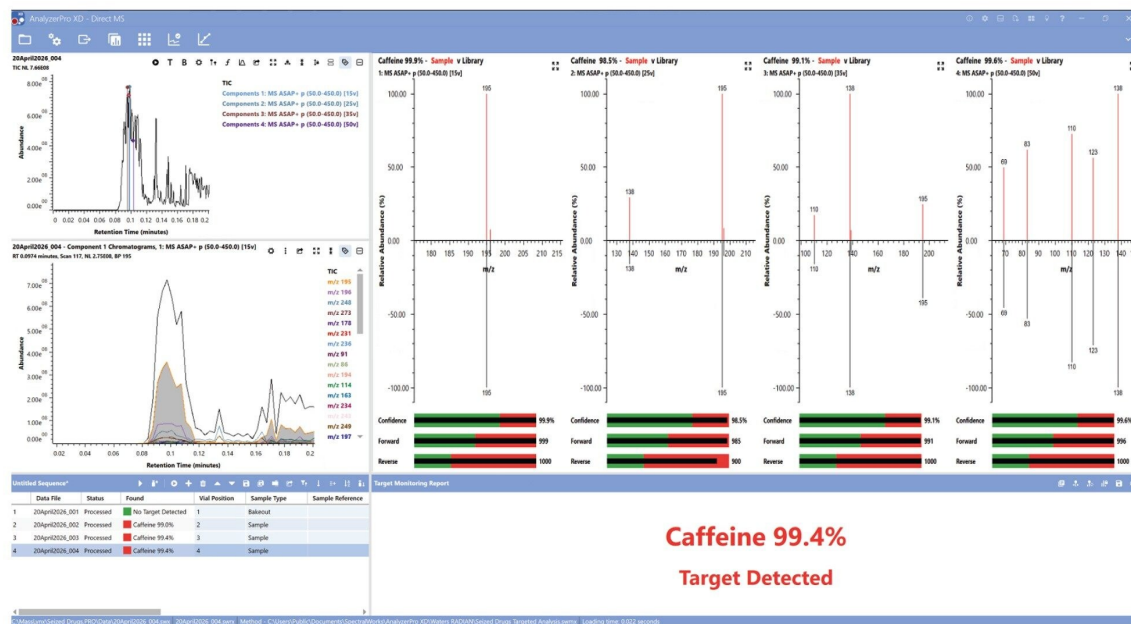
Figure 2. An example of the AnalyzerPro XD software results for seized sample #170. The upper panel shows the acquired spectra aligned with the corresponding cone voltage entries in the seized-drug spectral library, across all four cone voltages. The lower panel identifies caffeine as the predominant constituent, together with a match confidence of 99.4% following a 'dip-and-detect' analysis of the sample.

The results obtained using the RADIAN ASAP Mass Detector screening workflow demonstrated strong qualitative concordance with those generated by the Forensic Toxicology HRMS Screening Solution. Observed discrepancies between the two approaches are likely attributable to differences in analytical sensitivity and to variations in the respective reference library contents. In two sample groups, the RADIAN ASAP Mass Detector analysis yielded additional positive identifications beyond those reported by HRMS; however, the primary compound identified by HRMS was also correctly detected by RADIAN ASAP Mass Detector in each case. For sample group #170, the principal components identified by HRMS were not detected by RADIAN ASAP Mass Detector. Figure 2 presents an example output from the AnalyzerPro XD Software, as a representative sample from this group, demonstrating a positive identification of the major component, caffeine (99.4% confidence score). Amphetamine and TFMPP were also detected, although with lower identification confidence scores of 92% and 85.5%, respectively.