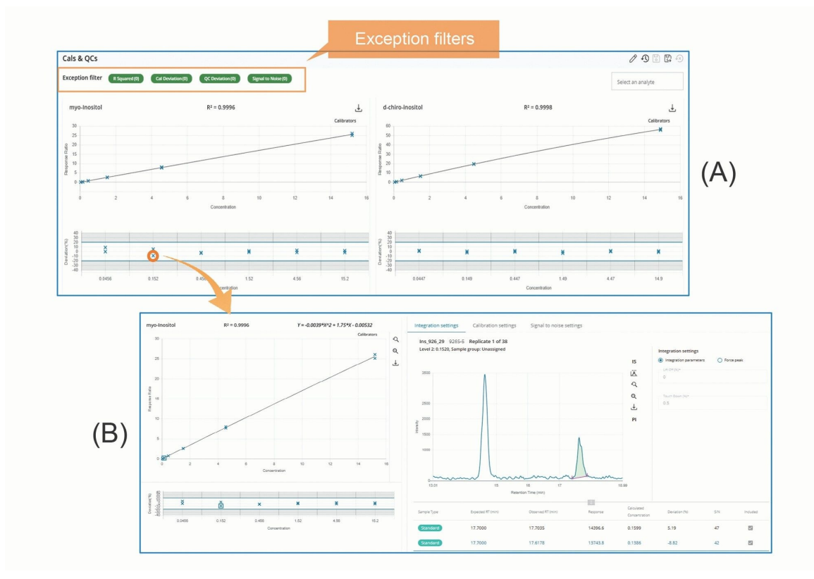
Figure 5. Screenshots of the Internal Standards Overview (A) and the individual injection review (B), accessible by clicking on a data point on the Overview page (indicated by the arrow). Exception filters are shown on the Overview page.