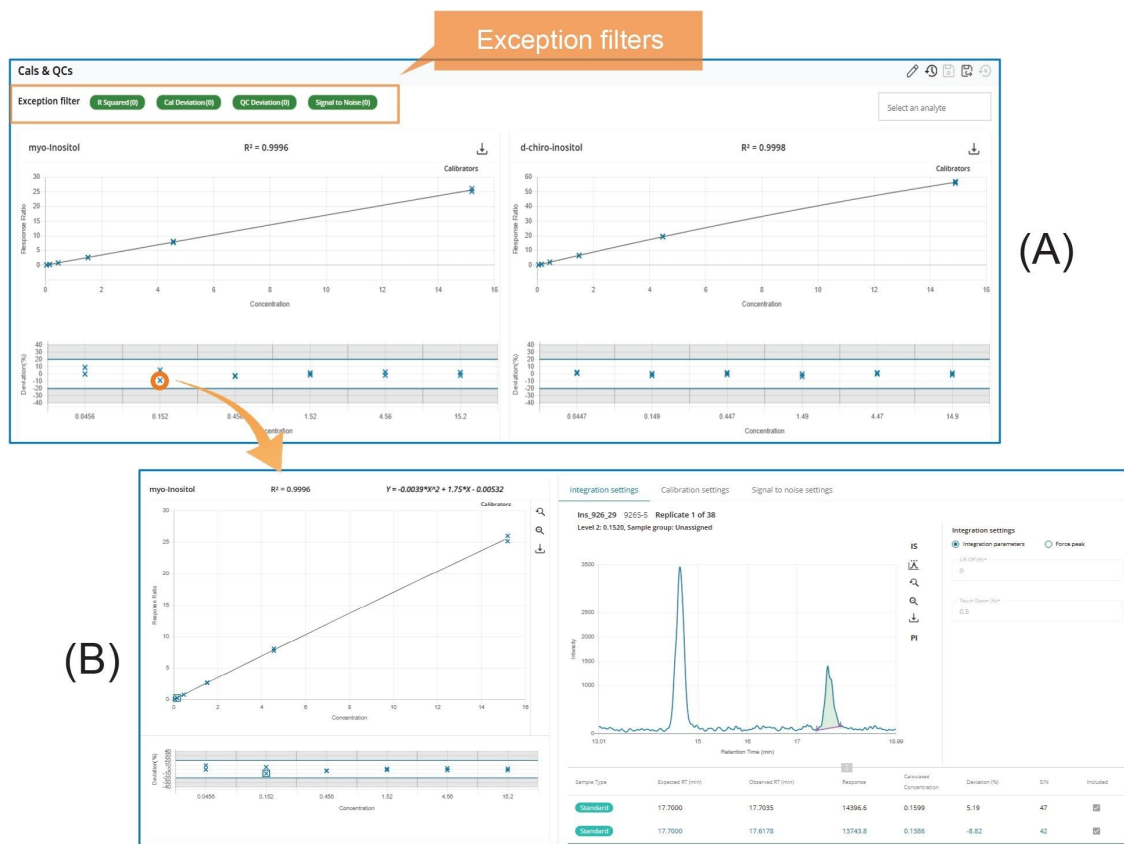
Figure 4. Screenshots of the Calibration Overview (A) and the individual calibration point review (B), accessible by clicking on a data point on the Overview page (indicated by the arrow). Exception filters are also highlighted on the Overview page.