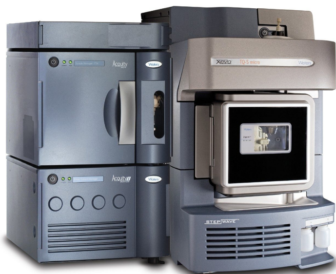
Figure 1. The ACQUITY UPLC I-Class PLUS System with Xevo TQ-S micro Mass Spectrometer.