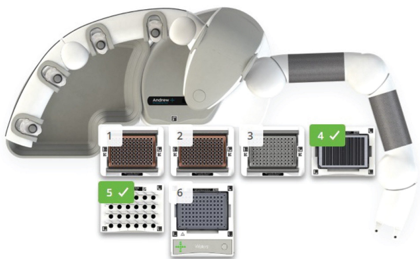
Figure 1. Top-down view of the Dominos positioned for the LNP protocol.

Two pipetting schemes, 12 samples (Figure 2A) and 16 samples (Figure 2B), were implemented. The 12-sample protocol, adapted from Invitrogen, is currently in use within our laboratory. The 16-sample scheme was developed from an optimization process, which is detailed in the following sections.