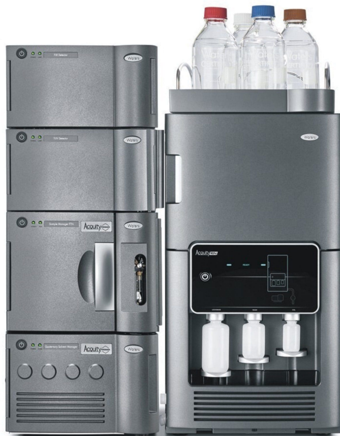
Figure 1. The ACQUITY Premier LC system coupled to the ACQUITY RDa Mass Detector.