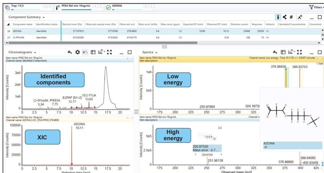
Figure 3. Screenshot of UNIFI sample review table featuring simultaneously acquired low and high energy spectral data visualizing structures of the intact ADONA (3H-perfluoro-3-[(3-methoxypropoxy)propanoic acid]) and fragment information.

Using the Full Scan with Fragmentation function allows cone voltage ramping to simultaneously acquire high and low energy spectra. The high energy data function, containing fragment ion information, was assigned automatically providing further confidence for compound identification with visual assignments to aid in speedy data appraisal (Figure 3).