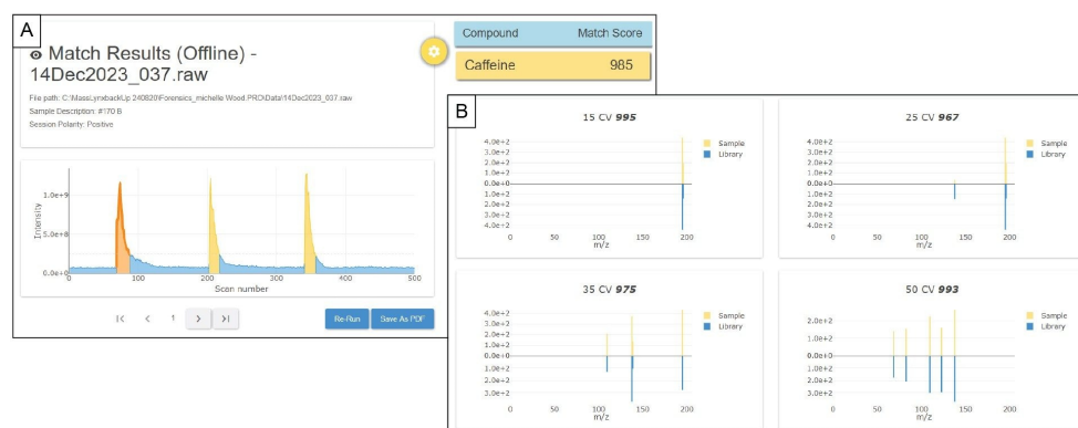
Figure 3. LiveID analysis of a seized sample. Panel A shows three “dip and detect” replicates for the sample and the match score 985 (maximum 1000) obtained for the first replicate. Panel B displays the detail for this spectral match; all four cone voltages are used in the identification process with the weighted mean (lowest cone voltage with the highest weighting) used.

The results obtained from screening with the RADIAN ASAP showed good qualitative agreement with the Forensic Toxicology HRMS Screening Solution. It is likely that any discrepancies between the results was due to the differences in analytical sensitivity and in library content. Two groups of samples resulted in additional compounds being positively identified by RADIAN ASAP analysis, however the main compound identified by HRMS was also positively detected. For group 170, the main components identified by HRMS analysis were not identified by RADIAN ASAP analysis. Figure 3 shows an example of the LiveID result obtained for one of the samples from this group; caffeine was positively identified. HRMS analysis resulted in the identification of 4 additional compounds including: methoxetamine, TFMPP, MDMA and 4-methylethcathinone. MDMA and TFMPP were identified on the RADIAN ASAP with a match score lower than the 850 cut-off which suggests these compounds were at low levels within the sample. Differences in the two-screening methods library content also had an impact for this group, as 4-methylethcathinone and methoxetamine are not currently included in the RADIAN ASAP seized drug reference library. We have previously described the quick process of updating the RADIAN library, which can enable laboratories to keep their reference libraries up to date with new emerging compounds. 5