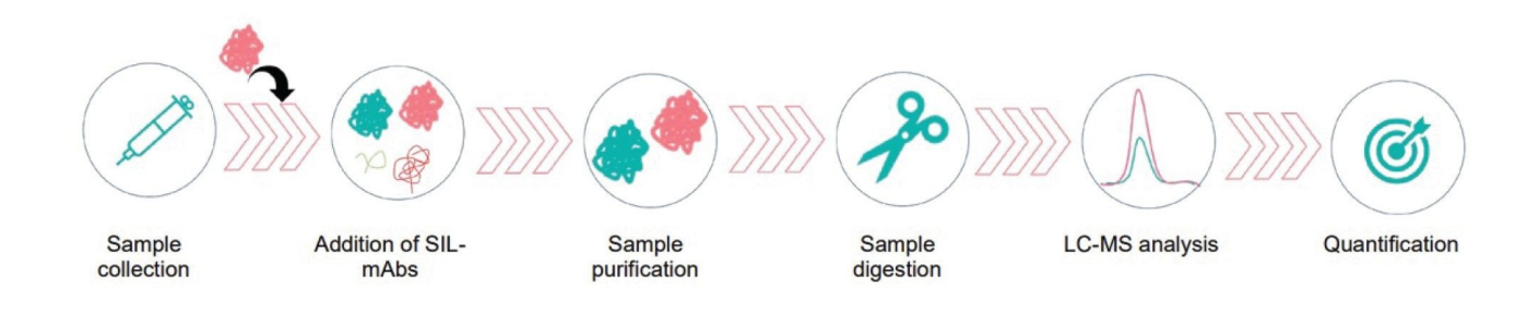
Figure 1. The LC-MS/MS workflow for the analysis of infliximab using the Promise Proteomics mAbXmise Kit (https://www.mabxmise.com/).

The calibrators, QCs and internal standard provided in the mAbXmise kit were used to demonstrate proof of performance, with calibrators ranging from 2–100 µg/mL and QCs at 4 and 25 µg/mL. In addition, analysis of 29 IFX plasma samples enabled comparison between different IFX signature peptide concentrations from the analysis.