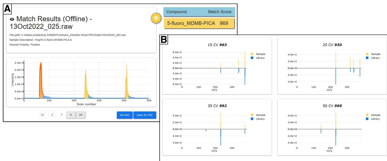
Figure 3. LiveID analysis of a sample prepared, infused with 50 \mu L of 5-Fluoro MDMB-PICA using the pipetting method. Panel A shows three “dip and detect” paper replicates for the infused sample and the match score 969 (maximum 1000) obtained for the first replicate. Panel B displays the detail for this spectral match; all four cone voltages are used in the identification process with a weighted mean (lowest cone voltage with the highest weighting) used.

In this study, samples at a lower concentration were also assessed; 6 samples were infused with individual drugs at 0.2 ng/mL. These samples resulted in slightly lower match scores than those infused with 1 mg/mL, however the match scores obtained still exceeded the threshold used for positive identification.