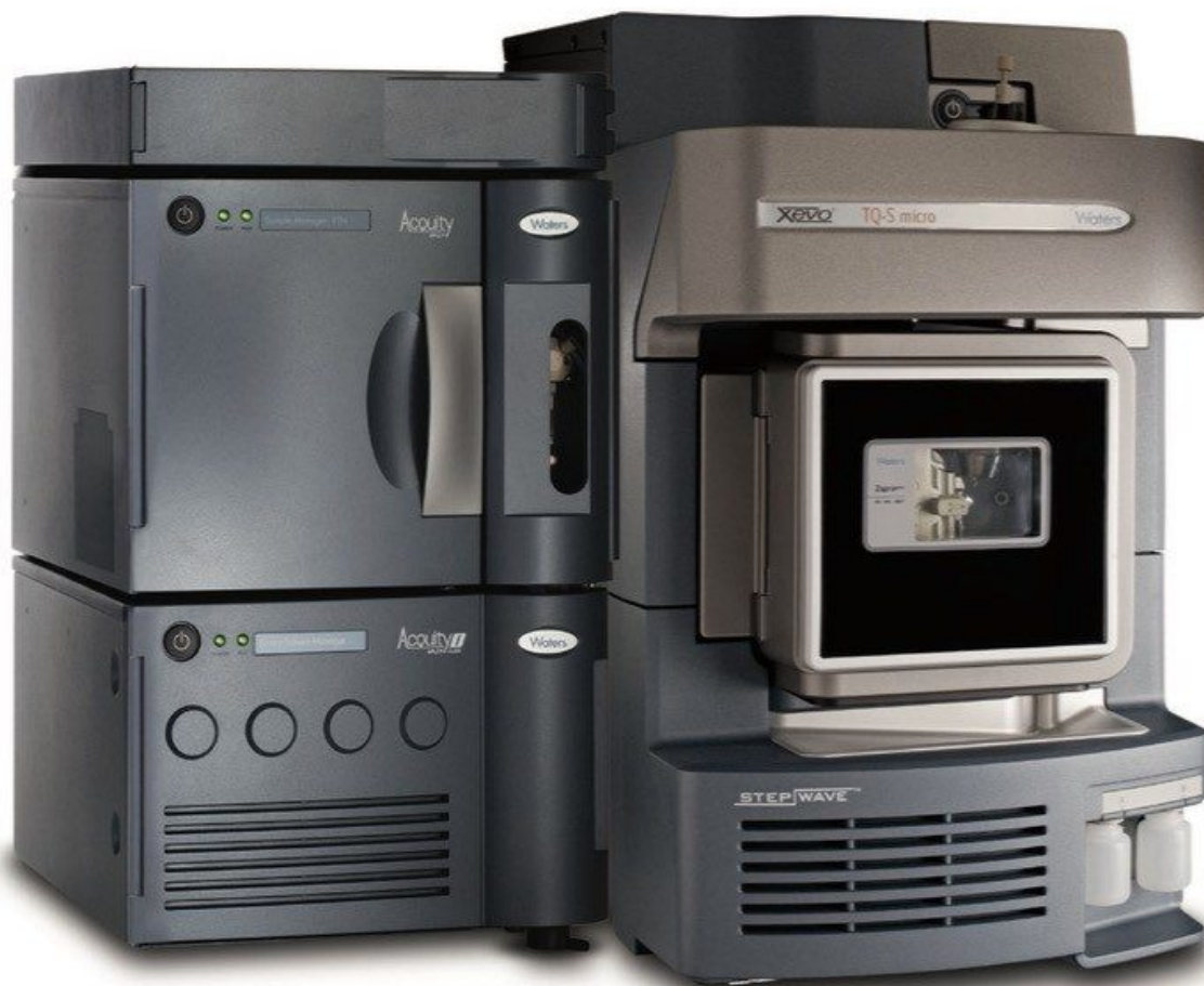
Figure 1. ACQUITY UPLC I-Class and Xevo TQ-S micro configuration.

Clinical research, laboratories require reliable testing techniques that can detect a wide variety of toxicants in highly complex biological matrices, such as ante and postmortem specimens. The Waters targeted clinical research analytical sensitivity application using the ACQUITY TQD System was released in 2009. 1 This approach has been used by Rosano et al to compare screening methodologies for postmortem blood samples. 2 Following its success, this solution was transferred in 2013 to the ACQUITY UPLC I-Class and Xevo TQD system. 3 The release of the Xevo TQ-S micro allows for further evolution of this solution. 4