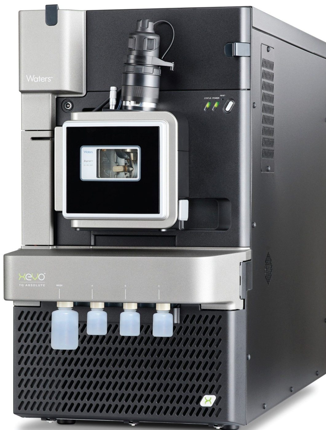
Figure 1. The Waters Xevo TQ Absolute Mass Spectrometer.