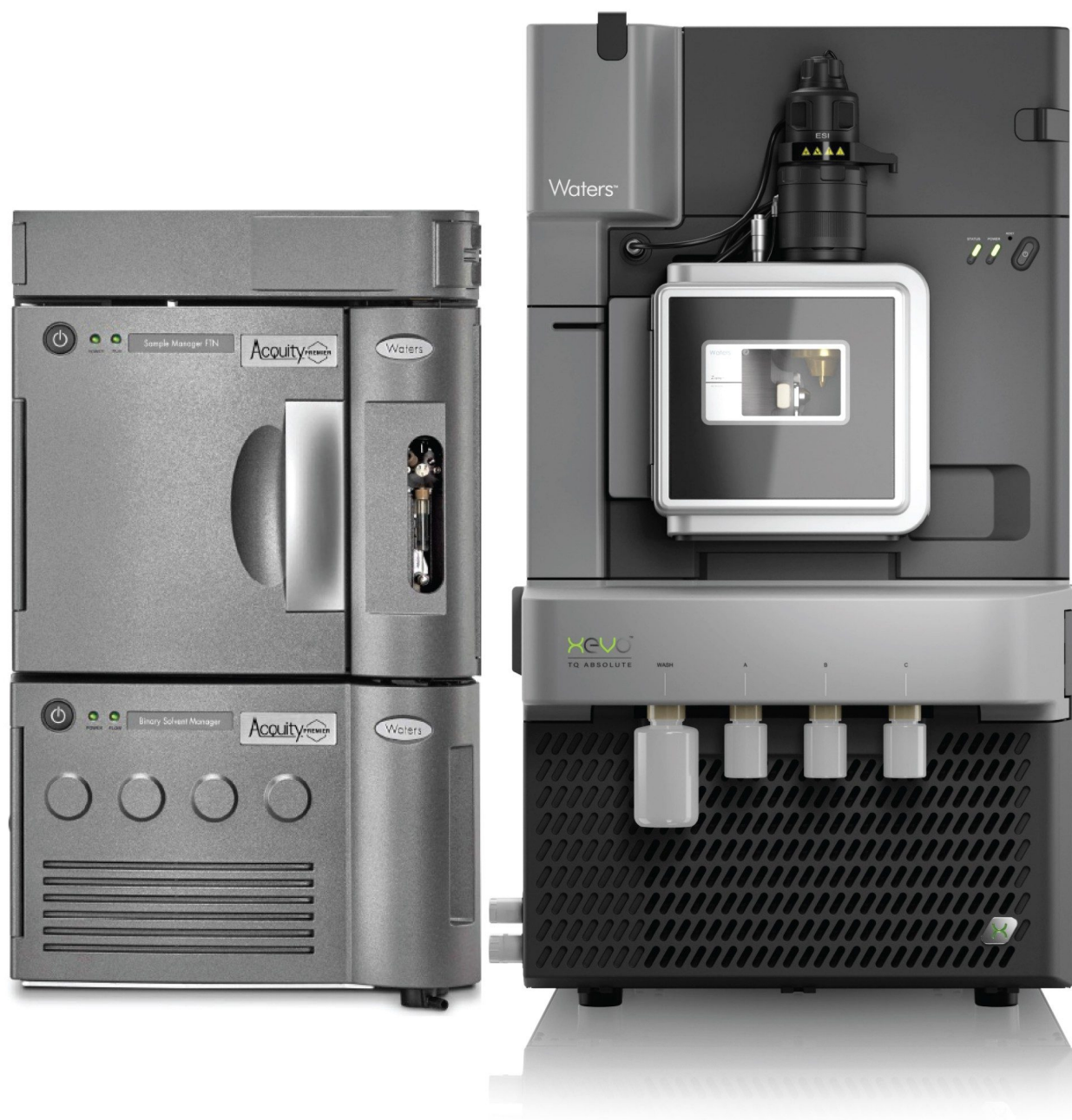
Figure 1. The Waters Xevo TQ Absolute Mass Spectrometer.