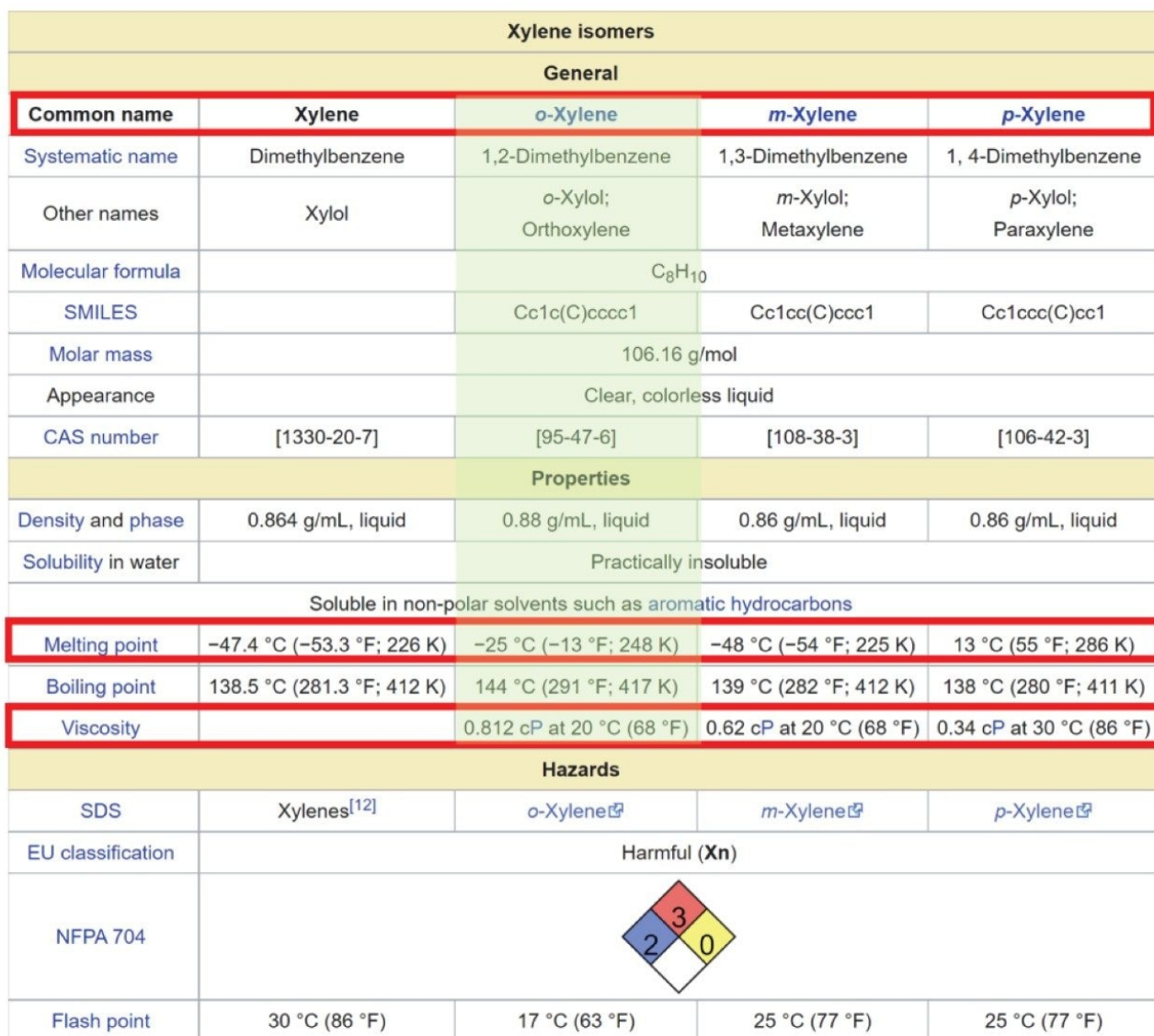
Table 1. Table of Xylene physical properties.