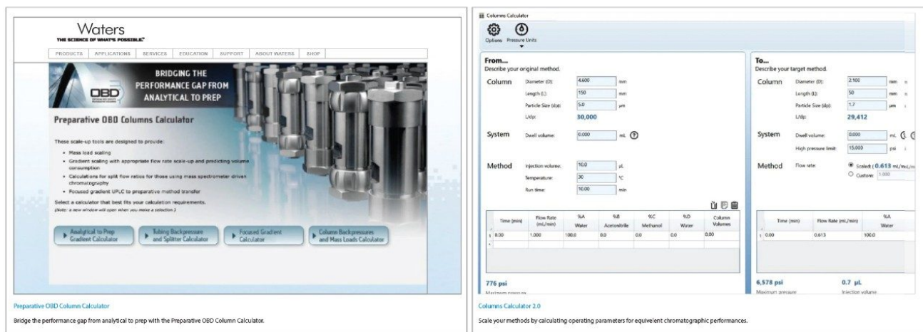
Figure 2. Waters Preparative OBD Column Calculator and the Columns calculator 2.0 online adjustment calculators ( www.waters.com ).

Manual gradient calculations for the target columns were confirmed using both the Waters Preparative OBD Column Calculator, and the Columns Calculator 2.0 (Figure 2). Online calculators were especially important because they provided an estimated maximum gradient backpressure for the adjusted gradients. This estimation, although computed for 100% organic mobile phase composition, rather than 85% organic composition in the monograph, added confidence that the adjusted methods would not exceed the 9,500-psi backpressure limit of the Arc HPLC System.