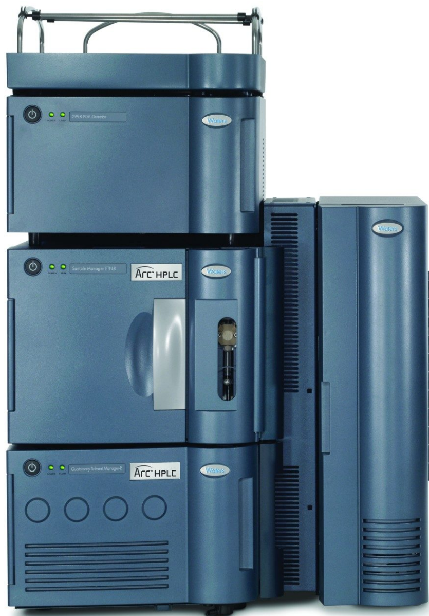
Figure 1. Arc HPLC System with PDA Detector.

In this application note, we employ the gradient method allowances described in General Chapter <621> Chromatography (December 1, 2022) to achieve both column and system modernization for the abacavir sulfate USP monograph (Table 1).