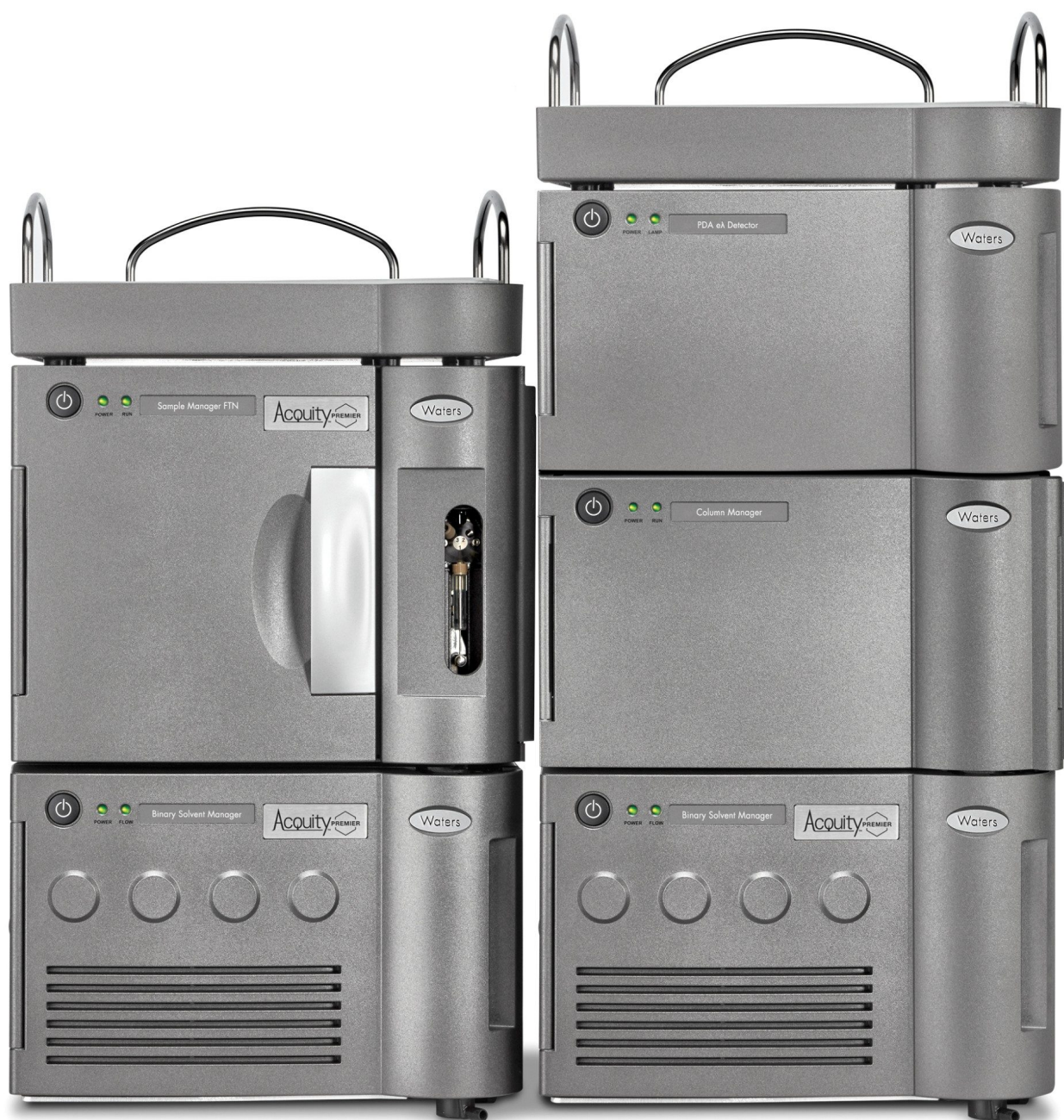
The ACQUITY Premier Multi-Dimensional System