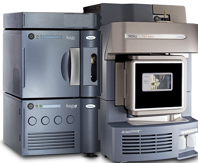
Figure 1. The Waters ACQUITY UPLC I-Class with FL System and Xevo TQ-S micro Mass Spectrometer.

Waters ACQUITY UPLC I-Class with FL System was completed within 1.5 minutes. Simultaneous analysis of all four analytes, followed by detection on a Xevo™ TQ-S micro Mass Spectrometer (Figure 1) was achieved with a time of under two minutes from injection-to-injection.