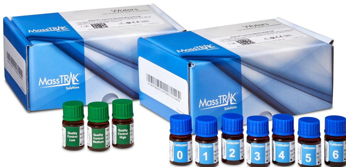
Figure 1. The Waters MassTrak Immunosuppressant Calibrator and Quality Control Sets.