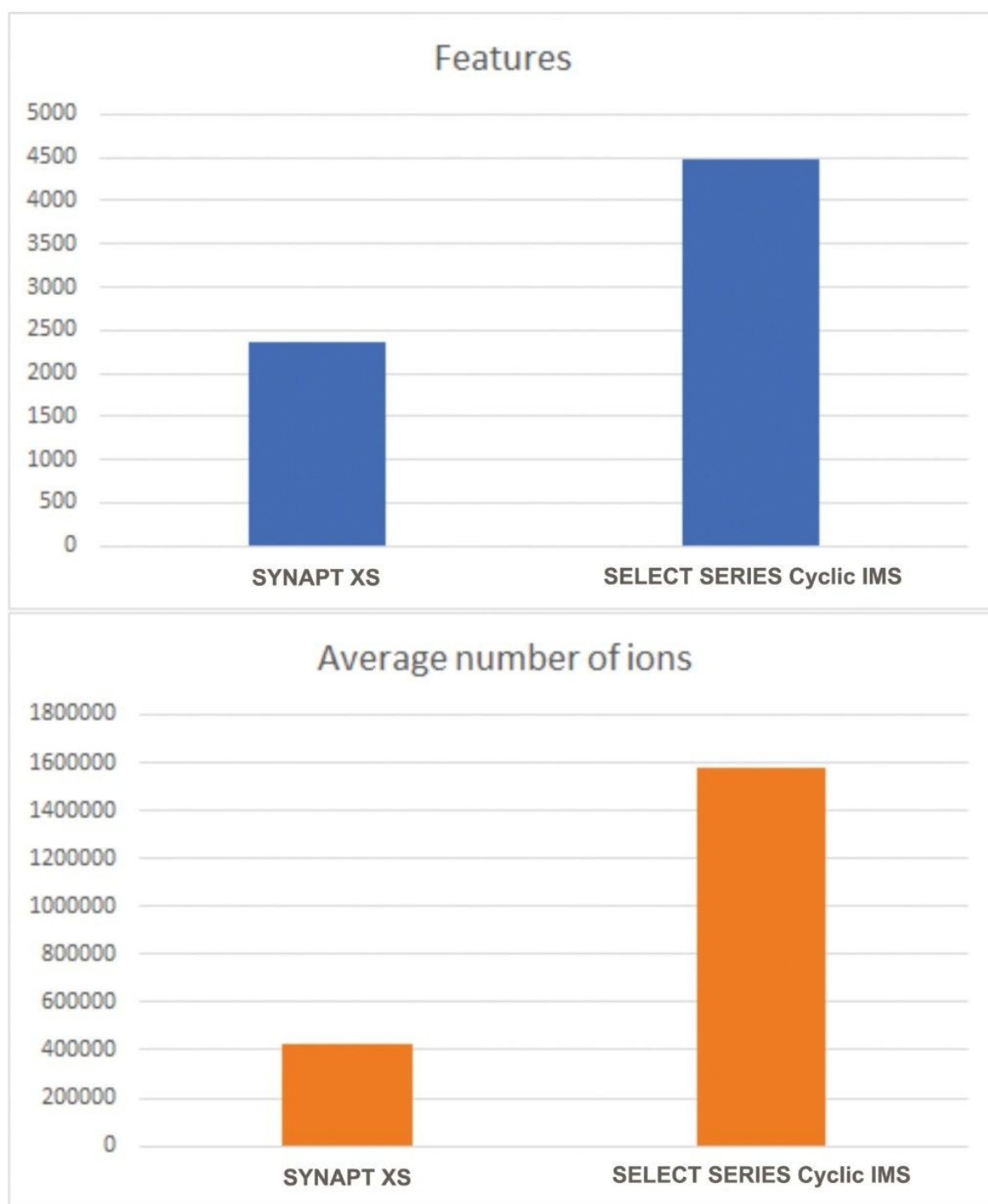
Figure 1. Comparison of the average number of peak-picked features and detected ions between the SYNAPT XS