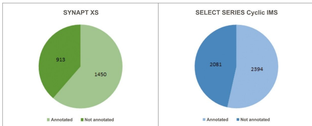
Figure 3. Pie charts outlining the number of features with tentative database annotations and those features without for both the SYNAPT XS and SELECT SERIES Cyclic IMS.