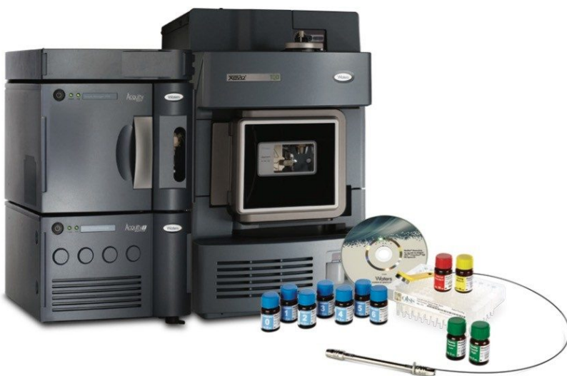
Figure 1. The Waters ACQUITY UPLC I-Class/Xevo TQD IVD System and MassTrak Vitamin D Kit.