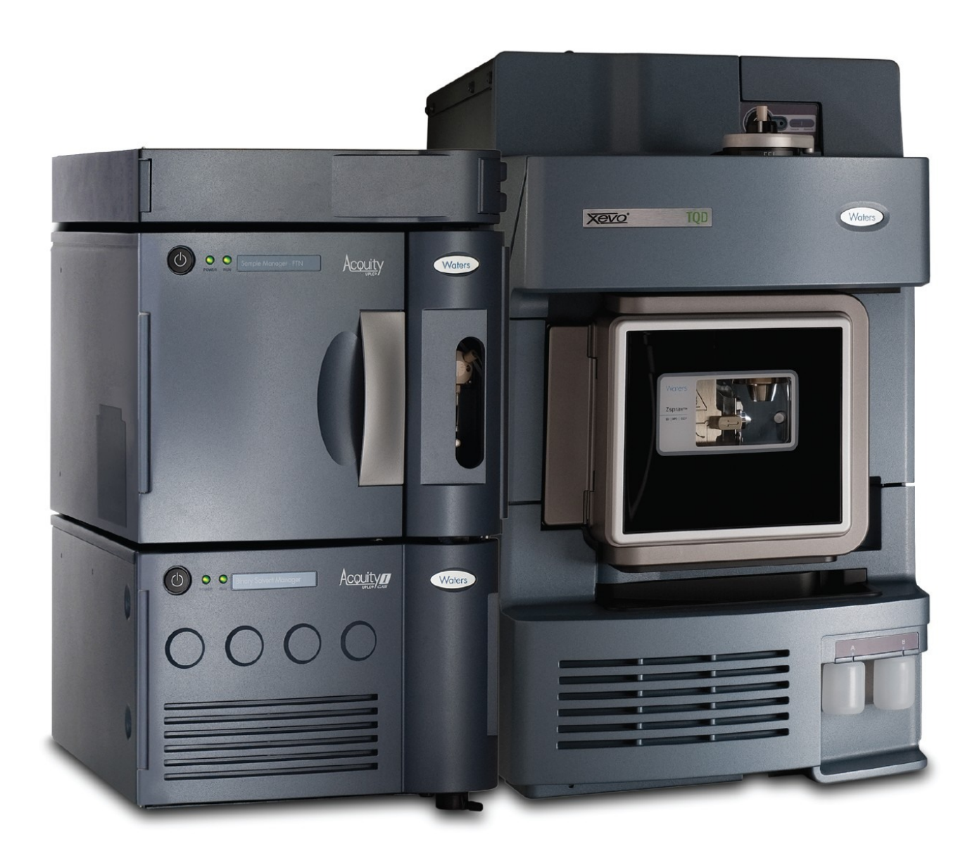
Figure 1. The Waters ACQUITY UPLC I-Class and Xevo TQD Mass Spectrometer.

a Waters ACQUITY UPLC BEH C<sub>18</sub> Column on a Waters ACQUITY UPLC I-Class followed by detection on a Xevo TQD Mass Spectrometer utilizing polarity switching (Figure 1).