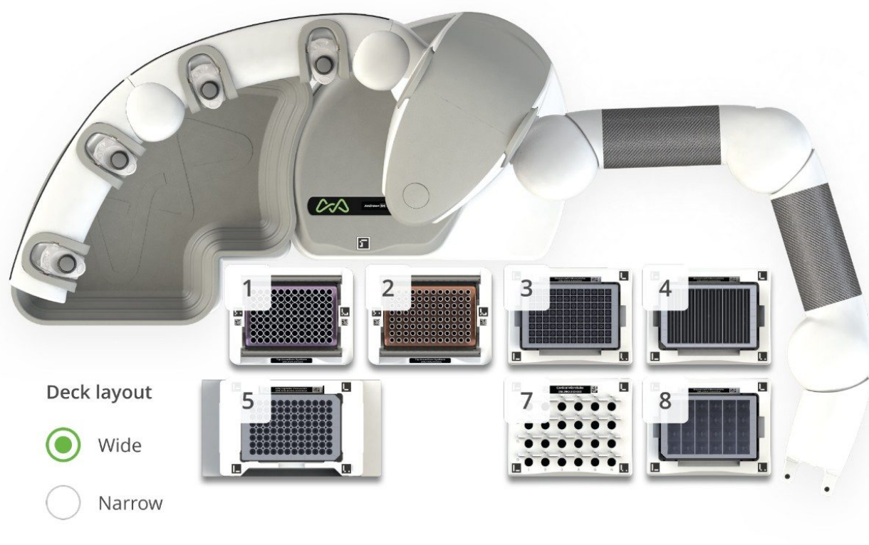
Figure 1. Andrew+ MMA Deck configuration – Dominos: 1 and 2: Tip insertion system; 3,4, and 8: Deepwell microplate; 5-: Microelution Plate Vacuum+; 7: Microtube.

When developing the protocol, improvements were made to the pipette liquid handling parameters to ensure smooth and consistent transfer of samples and thorough mixing within the Ostro Plate before extraction. A user prompt was added to the protocol for the evaporation step which was completed off deck for around 50 minutes. An additional suggestion is that the protocol could be split into two parts at this point to allow use of the Andrew+ in the meantime, if required. The deck configuration for this protocol can be seen in Figure 1.