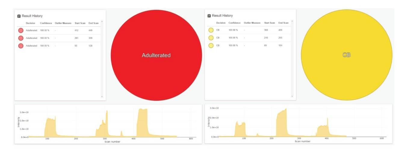
Figure 3. LiveID real-time recognition of pure cocoa butter or adulterated cocoa butter.

Independent validation of the model was carried out by analyzing triplicates of one pure and one adulterated cocoa butter sample that were not used in the model building. The model correctly classified the blind samples with 100% match confidence in the real-time recognition mode as depicted in Figure 3.