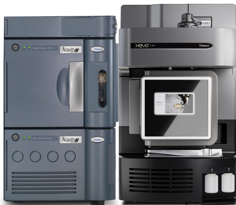
Figure 1. The Waters ACQUITY UPLC I-Class/Xevo TQD IVD System.