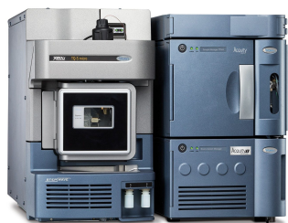
Figure 1. The Waters ACQUITY UPLC I-Class System and Xevo TQ-S micro Mass Spectrometer.