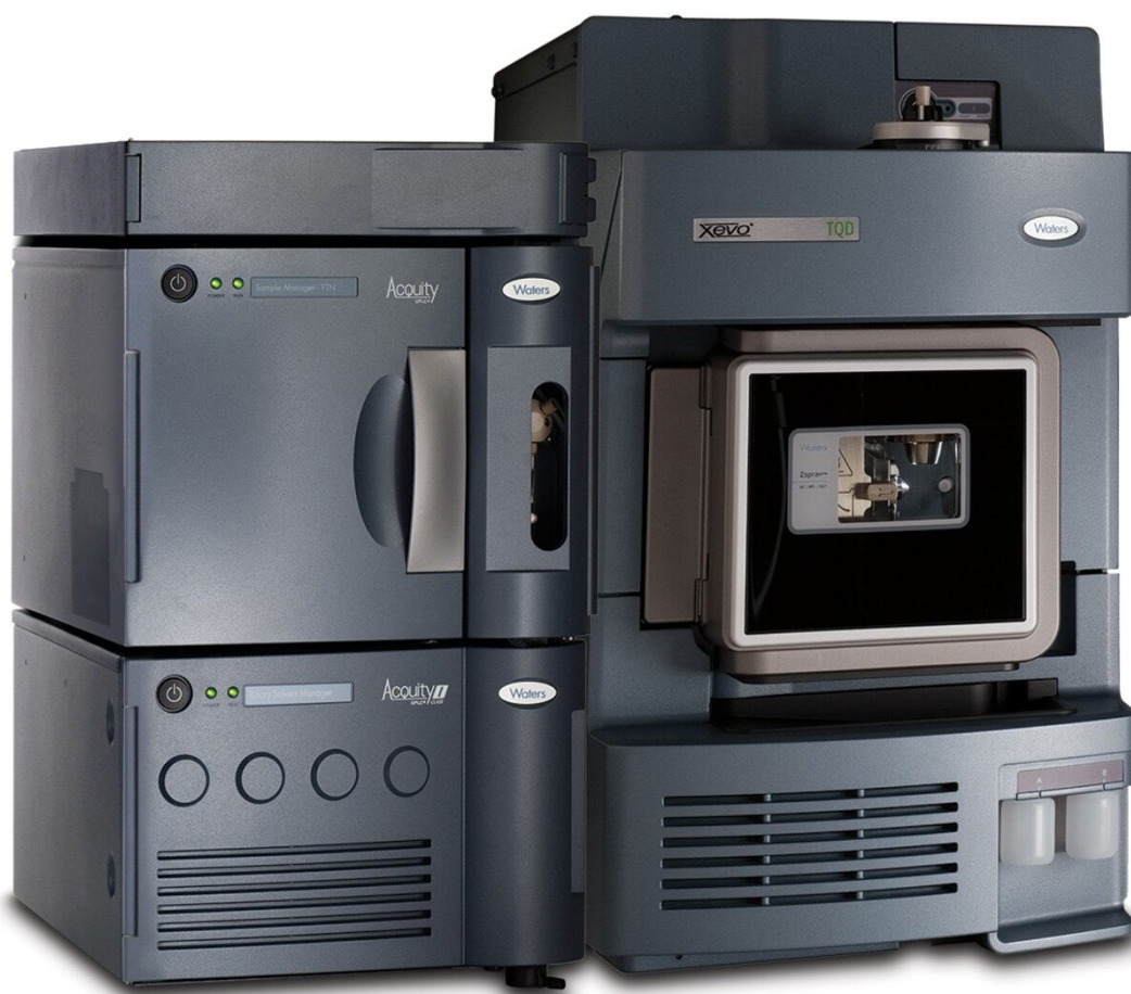
Figure 1. The Waters ACQUITY UPLC I-Class System with FTN and Xevo TQD Mass Spectrometer.