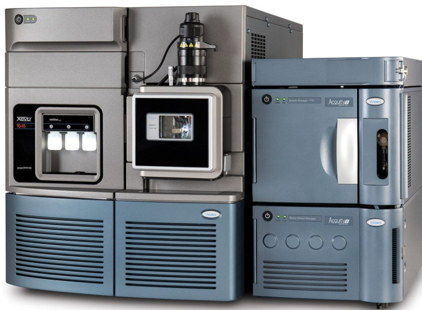
Figure 1. The Waters ACQUITY UPLC I-Class System and Xevo TQ-XS Mass Spectrometer.