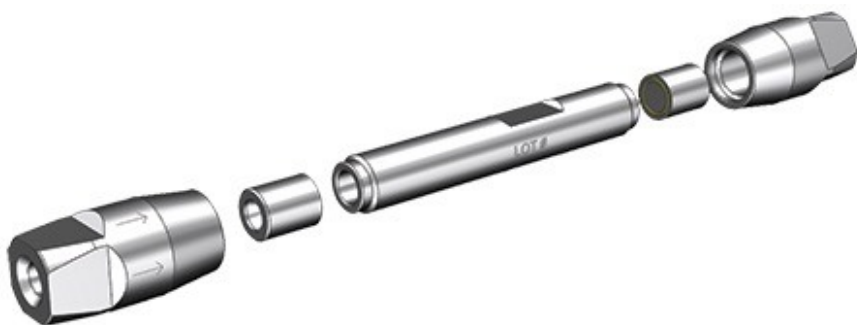
Figure 1. Explosion view of BioResolve SCX mAb Column hardware.

To demonstrate this corrosion resistance, the BioResolve SCX mAb Column hardware was subjected to extreme test conditions. Accelerated corrosion testing with 1 M sodium chloride, pH 7 shows a drastic difference between BioResolve SCX hardware and standard stainless steel hardware.