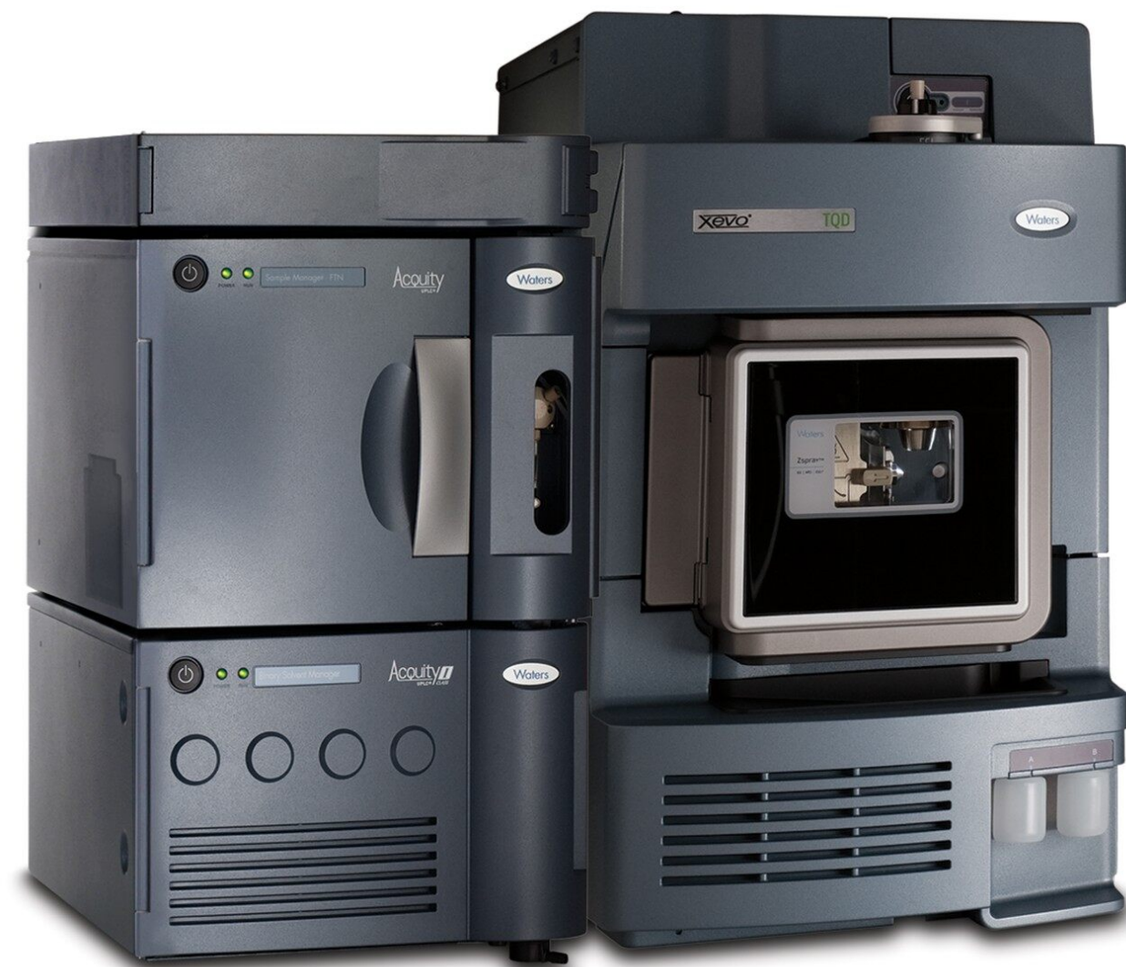
Figure 1. The ACQUITY UPLC I-Class System and Xevo TQD Mass Spectrometer.