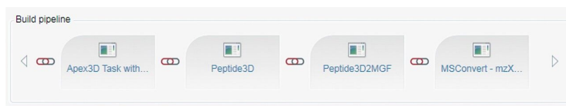
Figure 1. A Symphony pipeline example that chains 3D peak detection (Apex3D), deconvolution and deisotoping (Peptide3D), conversion to mgf, and subsequent MSConvert data conversion from mgf to mzML.

Shown in Figure 1 are the basis components of the conversion pipeline, available at https://marketplace.waters.com/home . 8 The first module detects peaks in multiple dimensions (retention time, drift time (HDMS E ) or quadrupole m/z (SONAR), m/z , and intensity), the resulted data matrix is deconvoluted to a peak list that contains m/z intensity pairs, which is subsequently converted to mgf, mzXML, and mzML files. The two latter conversion steps use a script and MSConvert, respectively. All executables and scripts are command line controlled by Symphony and the process is initiated from the sample list of the MassLynx instrument operating software. In practice, this means that the conversion from raw to processed data is conducted as soon as data acquisition finishes, typically when the LC-MS resets itself for the next injection. This means that all converted files are available for application analysis as soon as the LC-MS data acquisition finishes.