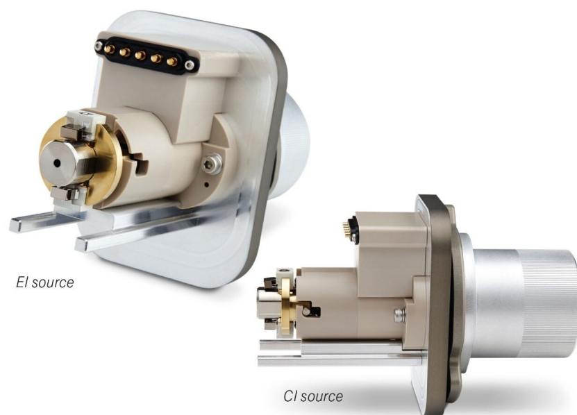
Figure 1. The Xevo TQ-GC is designed for simple, tool-free changeover between Electron ionization (EI) and Chemical ionization (CI) in less than 10 minutes.