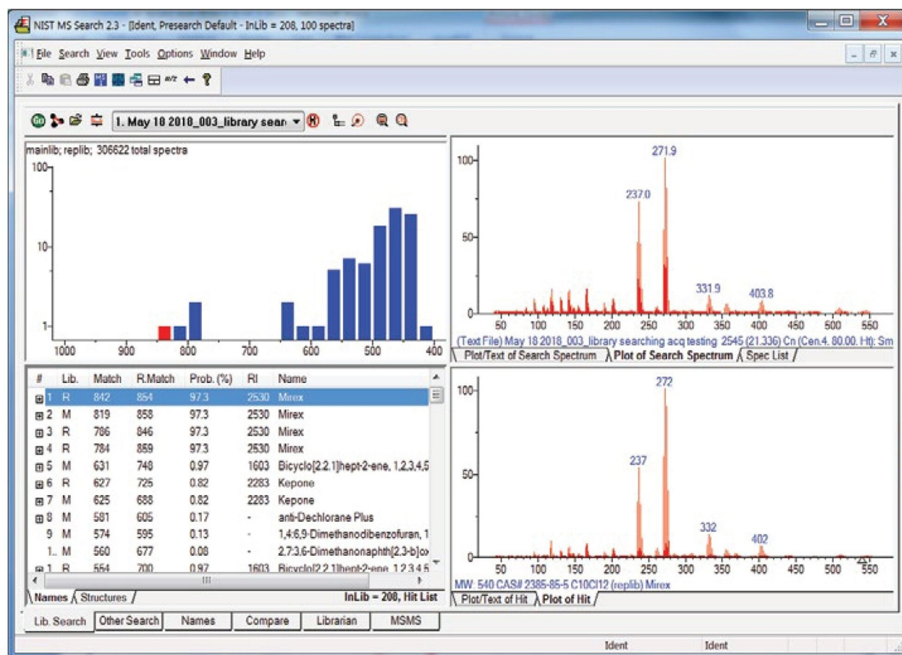
Figure 2. NIST library search results for mirex.