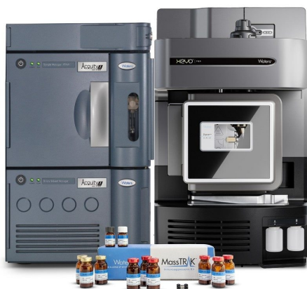
ACQUITY UPLC I-Class/Xevo TQD IVD System.