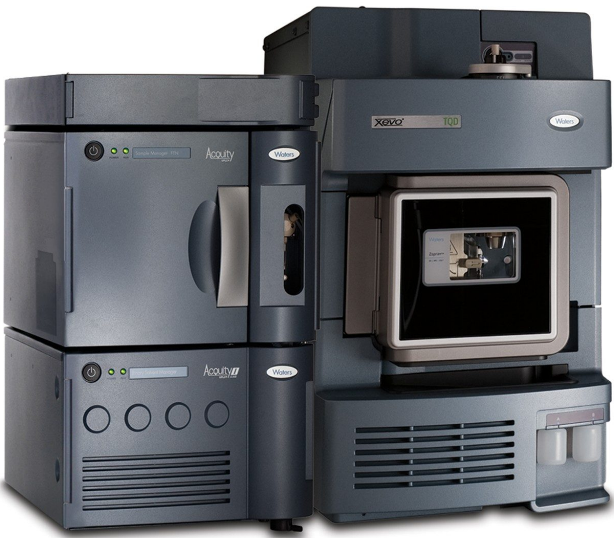
ACQUITY UPLC I-Class/Xevo TQD IVD System.