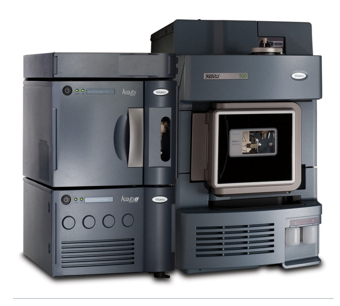
ACQUITY UPLCI-Class/Xevo TQD IVD System.