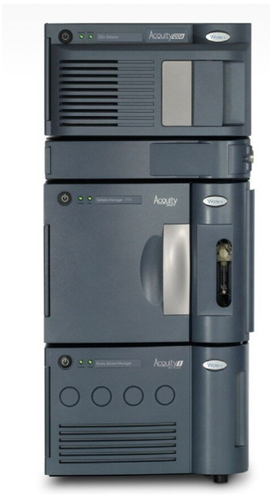
The ACQUITY UPLC I-Class System and ACQUITY QDa Mass Detector.