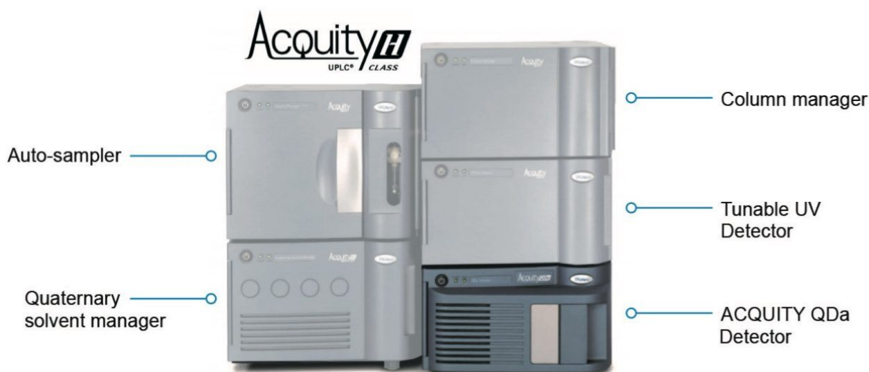
Figure 1. The ACQUITY QDa Detector. The compact footprint of the ACQUITY QDa Detector allows for easy integration into existing ACQUITY instrument stacks controlled by Waters Empower 3 Chromatography Data Software or MassLynx Software. Its plug-and-play design allows for the implementation of complementary orthogonal detection techniques with minimal effort into a single integrated system and workflow.

it was demonstrated that the ACQUITY QDa Detector is able to detect and report mass information for oligonucleotides over a wide molecular weight range. 1 To demonstrate that, the ACQUITY QDa Detector has applicability to a broader set of analytes beyond polyT standards, three types of oligonucleotides (siRNA, fully thioated or PS, and 2'OMe modified) representing the most commonly used in therapeutic settings were analyzed.