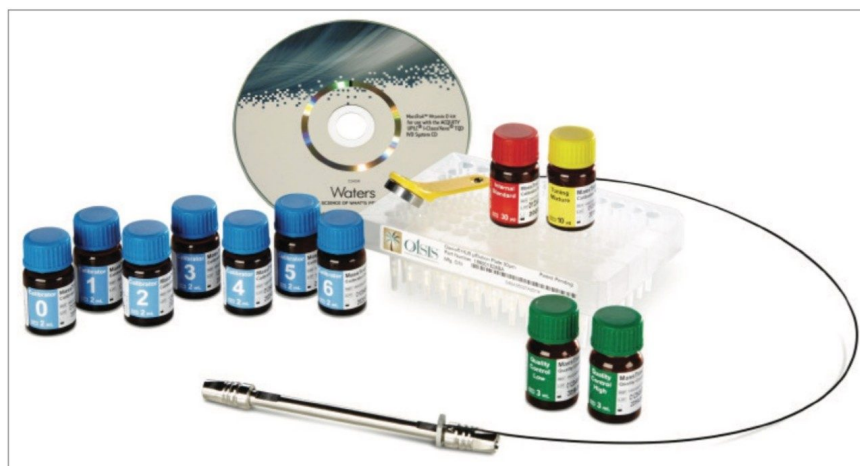
Figure 1. The MassTrak Vitamin D Kit.

The accuracy of the reagent kit calibrators is further assured through continuing participation in the Centers for Disease Control and Prevention (CDC) Vitamin D Standardization-Certification Program (VDSCP) for total 25OHD.