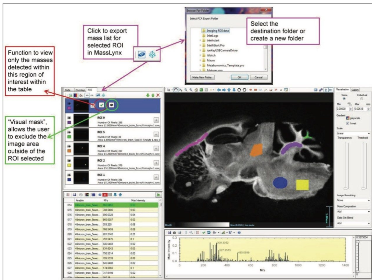
Figure 2. Workflow for the selection of an ROI, for filtering of the mass list or application of a visual mask. Export processing workflow is also demonstrated.