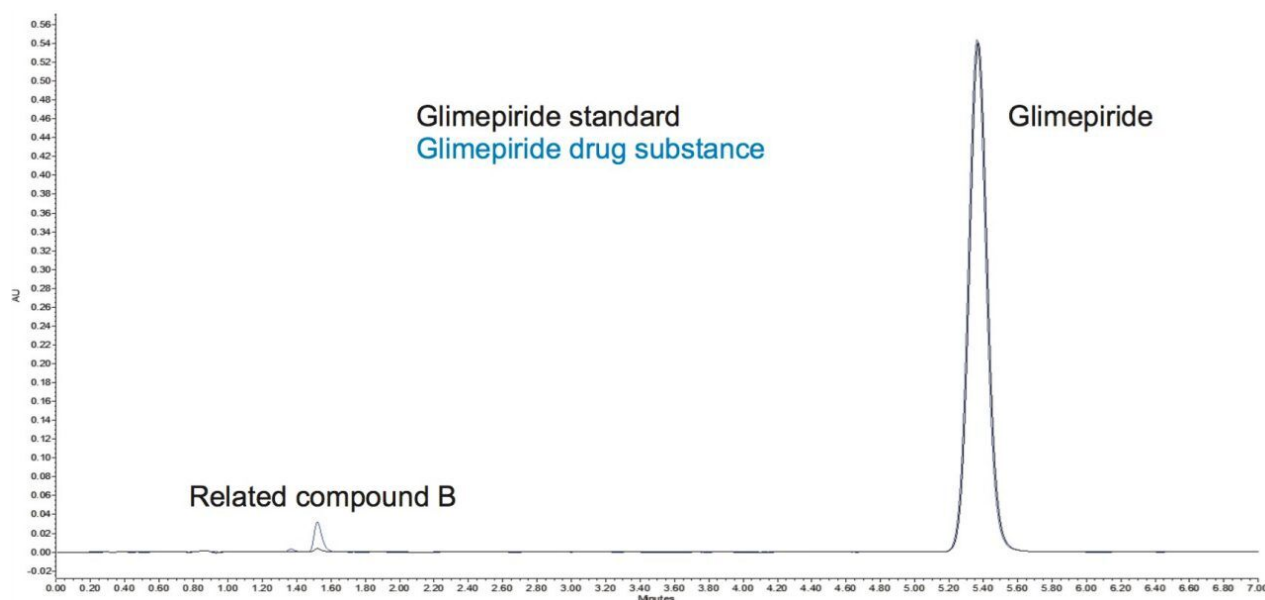
Figure 3. Overlay of standard and sample chromatograms on the Alliance HPLC system, performed using the scaled column dimensions. Blue chromatogram is the sample, black chromatogram is the standard.

As mentioned previously, the active pharmaceutical substance of glimepiride was analyzed using the scaled assay for glimepiride (Figure 3). The percentage of glimepiride was found to be 99.67%. This value was calculated by using the formula found in the USP monograph.