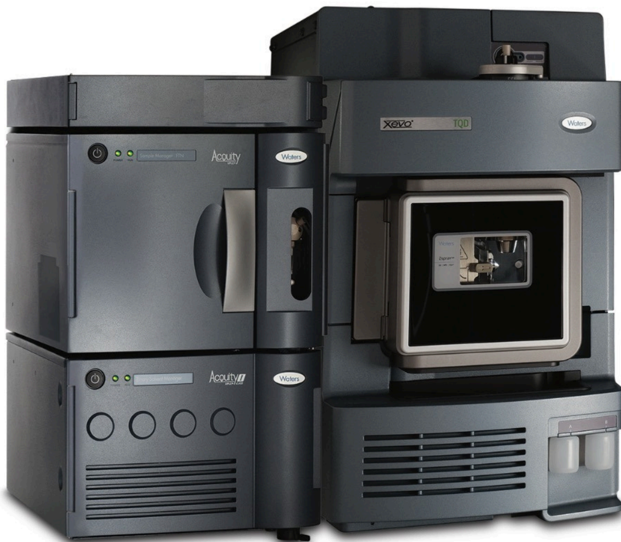
Figure 1. The Waters ACQUITY UPLC I-Class and Xevo TQD.