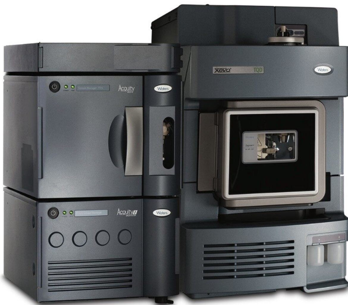
Figure 1. The Waters ACQUITY UPLC I-Class and Xevo TQD.