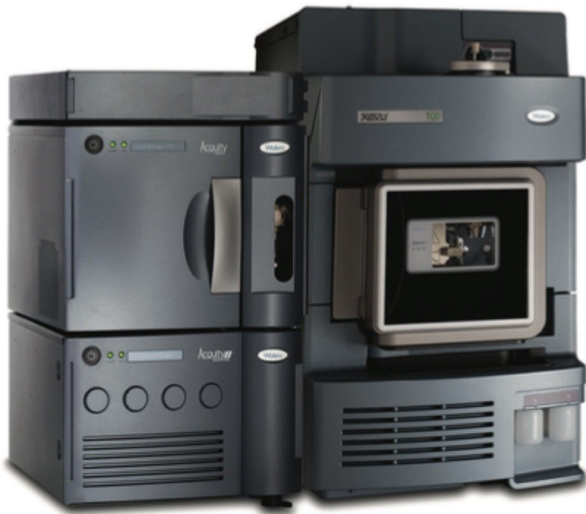
Figure 1. Waters ACQUITY UPLC I-Class System and Xevo TQD Mass Spectrometer.