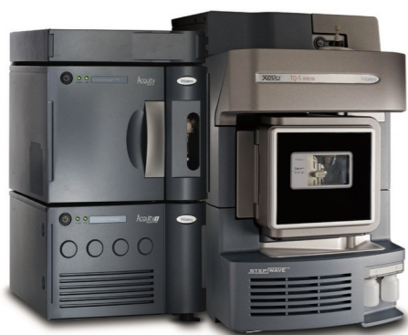
Figure 1. ACQUITY UPLC I-Class and Xevo TQ-S micro configuration.

Forensic toxicology laboratories require reliable screening techniques that can detect a wide variety of toxicants in highly complex biological matrices, such as ante and postmortem specimens. The Waters targeted toxicology screening application using the ACQUITY TQD System was released in 2009. 1 This approach has been used by Rosano et al to compare screening methodologies for postmortem blood samples. 2 Following its success, this solution was transferred in 2013 to the ACQUITY UPLC I-Class and Xevo TQD system. 3 The release of the Xevo TQ-S micro allows for further evolution of this solution. 4