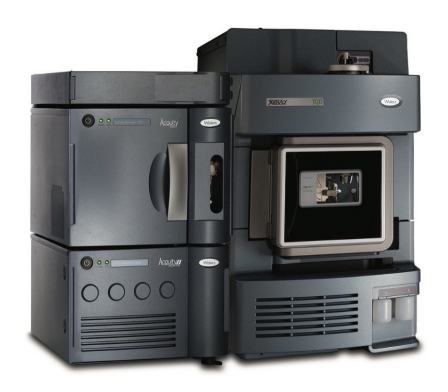
Figure 1. The Waters ACQUITY UPLC I-Class and Xevo TQD.

Here we describe a clinical research method utilizing Oasis PRIME HLB µElution Plate technology for the extraction of testosterone, androstenedione, and DHEAS from serum, which has been automated on a Tecan Freedom Evo 100/4 Liquid Handler. Chromatographic separation was performed on an ACQUITY UPLC I-Class System using an ACQUITY UPLC HSS T3 VanGuard Pre-column and ACQUITY UPLC HSS T3 Column, followed by detection on a Xevo TQD Mass Spectrometer (Figure 1). In addition, we have evaluated External Quality Assessment (EQA) samples for testosterone, androstenedione, and DHEAS to evaluate the bias and therefore suitability of the method for analyzing testosterone, androstenedione, and DHEAS for clinical research.