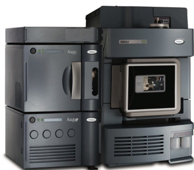
Figure 1. The Waters ACQUITY UPLC I-Class and Xevo TQD.

Liquid Handler. Chromatographic separation was performed on an ACQUITY UPLC I-Class System using an ACQUITY UPLC HSS T3 VanGuard Pre-column and ACQUITY UPLC HSS T3 Column, followed by detection on a Xevo TQD Mass Spectrometer (Figure 1). In addition, we have evaluated External Quality Assessment (EQA) samples for testosterone, androstenedione, and DHEAS to evaluate the bias and therefore suitability of the method for analyzing testosterone, androstenedione, and DHEAS for clinical research.