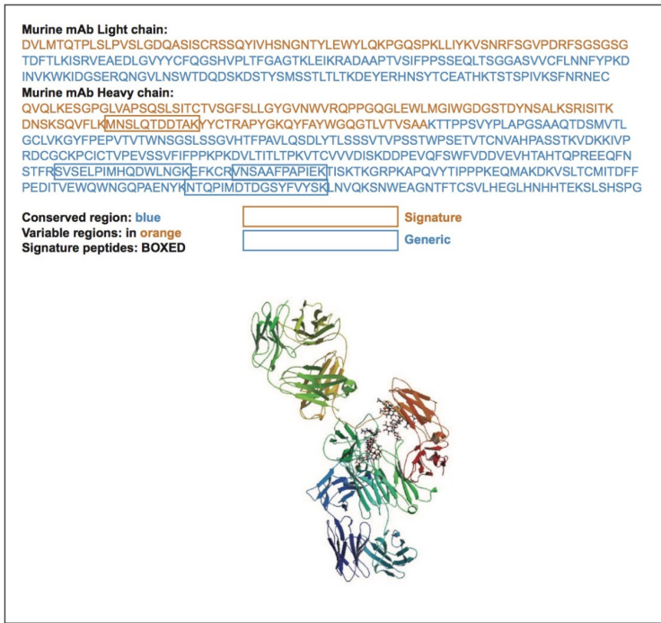
Figure 1. Sequence and signature peptide options for the intact murine antibody standard.