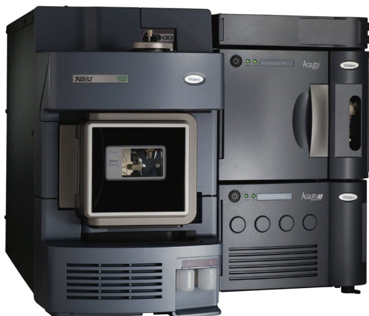
Figure 1. The Waters ACQUITY UPLC I-Class System with the Xevo TQD.

methotrexate- ^2\text{H}_3 internal standard in methanol. Isocratic separation was achieved within five minutes using an ACQUITY UPLC HSS \text{C}_{18} SB Column (2.1 x 30mm, 1.8 \mu\text{m} ) on an ACQUITY UPLC I-Class System followed by detection on a Xevo TQD Mass Spectrometer (Figure 1).