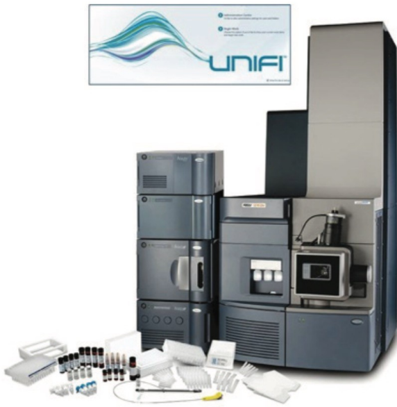
Figure 1. Biopharmaceutical System Solution with UNIFI for glycan analysis.

UNIFI Scientific Information System v1.7.1